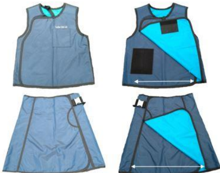
Closed wrap-around vest and skirt (has a back panel)

A vest and skirt may provide better weight distribution and comfort than a one-piece apron.