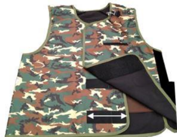
Closed vest (has a back panel)

Note that there is only partial overlap at the front so both panels would need to be specified with at least 0.35 mm Pb.