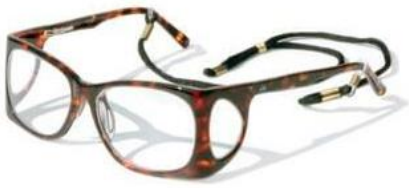
Example of a Standard Model: Front and Side Protection