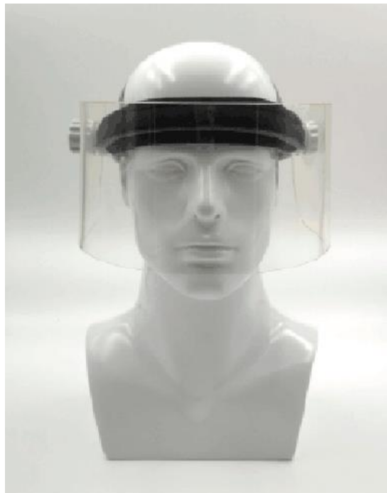
Medical Index MI-Mask01