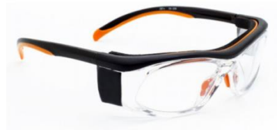
Example of a Sport Model: Front and Side Protection