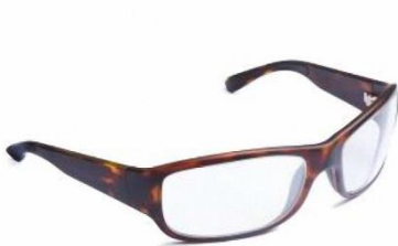
Example of a Vintage Model: Front Protection